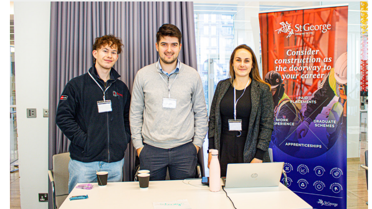
Staff from St George Plc at the Green Futures event in March 2025

In partnership with London Clean Air, we delivered the first 'Green Futures' event to help connect young people with career opportunities in sustainability including engineers, architects, renewable installers and more – all of which are essential for us meeting our ambitions in our Climate Action Plan. CCA members Troup Bywaters + Anders, Sheppard Robson, St George PLC and Heath Hands attended to promote career opportunities in their organisations. In addition, 17 CCA members have signed Camden Council's STEAM Pledge, committing their organisations to providing opportunities for young people.