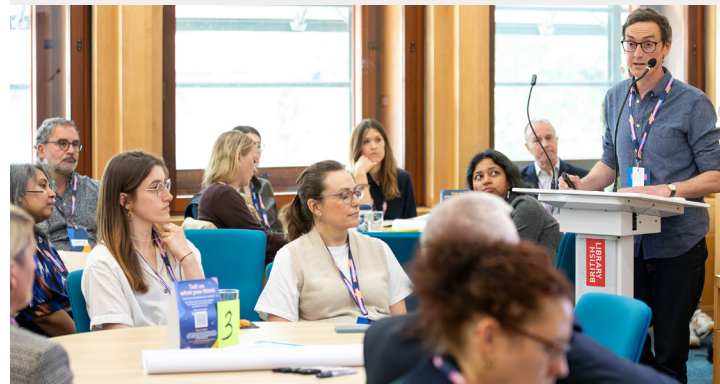
Businesses attending a workshop at Camden's 2025 We Make Camden Summit

In 2025, four training sessions were delivered on carbon footprinting, sustainability communications, funding opportunities and certification pathways. The sessions provided guidance for SMEs on topics including Scope 1, 2 and 3 emissions, calculating carbon footprints, accessing support through the Camden Climate Fund, and B Corp certification.