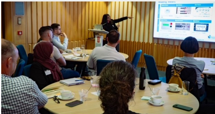
Energy management training delivered for businesses as part of the Camden & Brent Business Challenge

By the end of the programme, we had supported 146 businesses through its offerings including 85 energy audits and 7 trainings. Preliminary findings from the programme's evaluation shows an average reduction amongst participants of 7% since 2024, with a 14% reduction in gas usage.