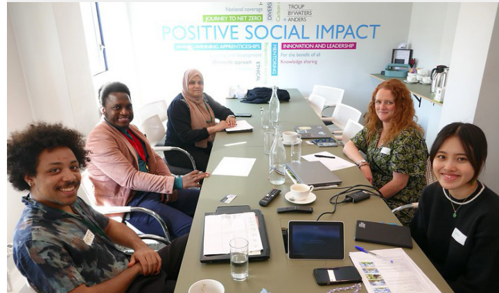
The 2025 Judging panel or 'Dragons' from Think & Do Camden, Troup Bywaters + Anders and Anthesis

Our Green Dragons' Den is an annual event for Key Stage 2 students to develop and pitch sustainability projects for their schools. Students present their ideas to a panel of "Dragons" to secure funding. In 2025, eight schools took part, securing £3,200 in funding. Projects included a clean air green fence, window film to reduce solar gain, and contributions to a school's solar PV project. The programme not only funds sustainability initiatives in schools but also helps students build pitching skills and deepen their understanding of the climate crisis, while supporting them to develop their own project ideas.