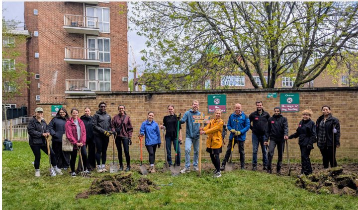
BMA House supporting with green space maintenance at Bayham Place estate

Case studies highlighting the range of projects supported are available here .