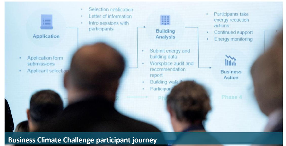
Business Climate Challenge participant journey