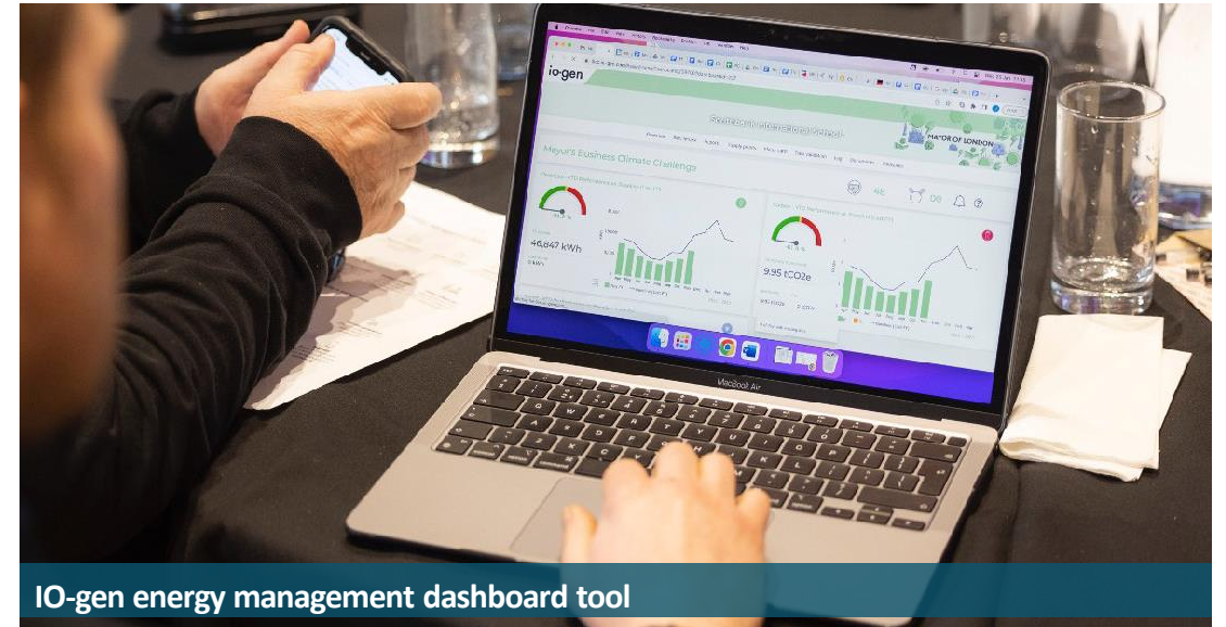
IO-gen energy management dashboard tool

More than half of participants can meet or exceed the 10% energy reduction target by implementing energy-efficiency measures with an av. Cost of £3,800.