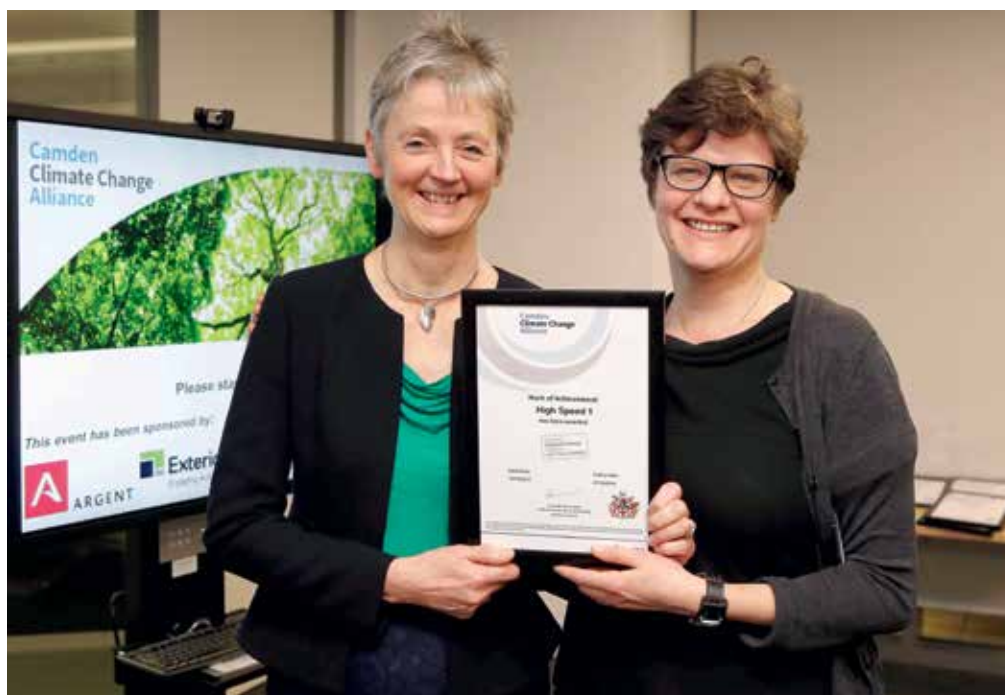
CCCA Members High Speed 1 receive their Mark of Achievement.