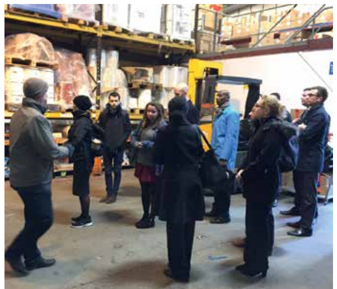
CCCA members visit Alara to learn about their initiatives with waste minimisation.

Look out for upcoming events on our www.camdencca.org/events