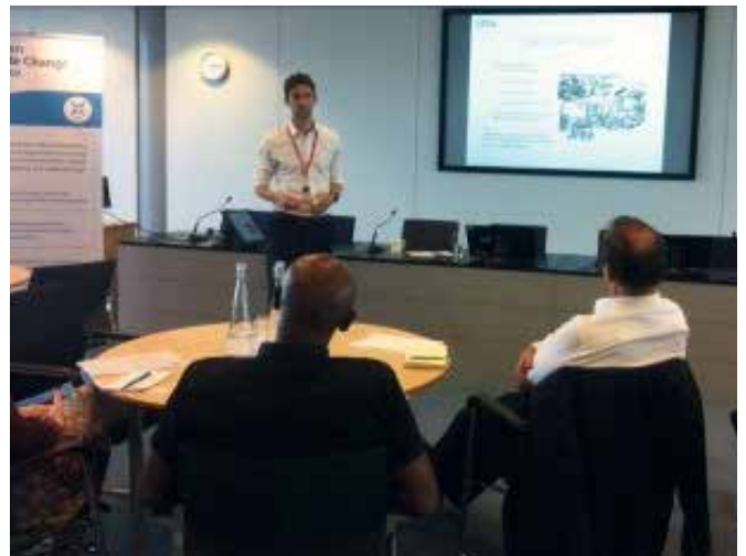
CCCA members attend Carbon Footprint workshop to learn more about their carbon impact.

The CCCA Re-Launch Event brought over 80 CCCA members together to officially present the new CCCA branding, premium membership and service offering as well as celebrate the year's successes and Marks of Achievement.